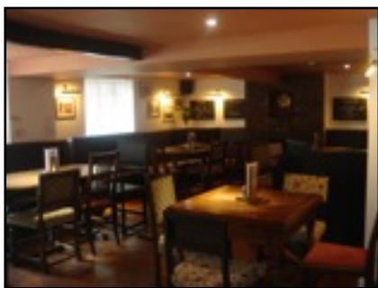
Above: The snug Below: The Tap Room